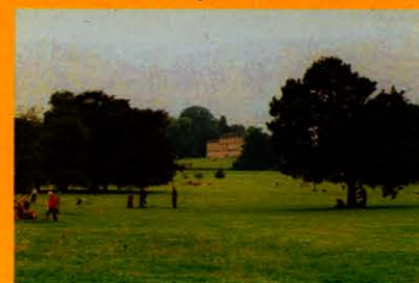
Cannon Hall Country Park

Gunthwaite is secluded and charming, with its impressive barn, magical Spa and idyllic Dam. Beyond the A635 the influence of the Cannon Hall estate becomes apparent. Deffer Wood, north of Spring House and Jowett House farms, is well worth a detour, or a return visit.