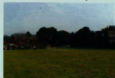
Home Farm, Cannon Hall Country Park