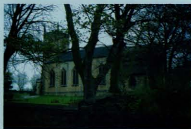
St. John's Church, Upper Denby

2 After passing through Upper Denby village turn right immediately after the railway bridge and ascend the stone steps. Follow the path and lane towards Gunthwaite Hall.