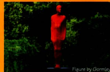
Figure by Gormley