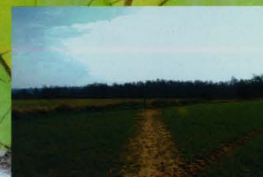
Applehaigh Wood, Old Royston

10 Notton Bridge carries the road over a railway. High Bridge carries the road over the Barnsley Canal. The Trans Pennine Trail descends to join the canal footpath. The Barnsley Boundary Walk continues along Navy Lane.