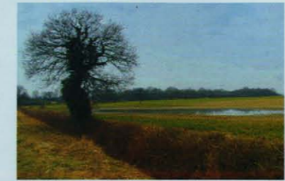
Navy Lane, High Bridge

1 Our walk starts at High Bridge on Navy Lane. High Bridge carries the road over the Barnsley Canal at Old Royston. The route follows the road to a T junction.