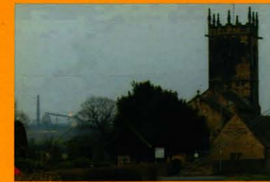
St. Peter's Church, Felkirk

Amidst all this the hamlet of Felkirk with its impressive church lives on as a timeless feature in an otherwise much changed landscape