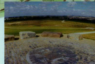
Phoenix Park, Thurnscoe