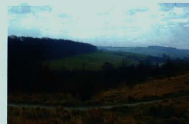
Tom Bank Wood

9 The path bears left and left again across a wooden footbridge. 600 yds further on cross a bridge over the railway line and head to Chapel Lane, north of Thurnscoe East.