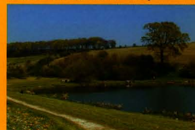
'The Dell' Nature Reserve, Brierley

Again in contrast, the former mining villages of Thurnscoe, Goldthorpe and Bolton upon Dearne are engaged in the revitalisation which extends across the Dearn Valley.