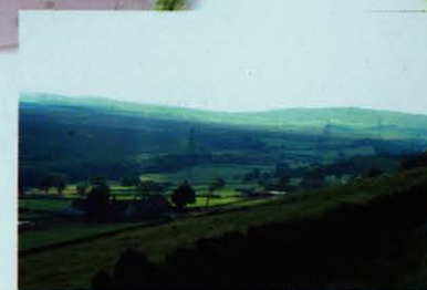
View of Thurlstone Moors

2 At the wide track above Brook House Bridge turn right onto Brook House Lane alongside Hagg Brook, then left onto the wide track running parallel to Badger Lane Brook. At the end of the track bear right onto Swinden Lane (bridleway).