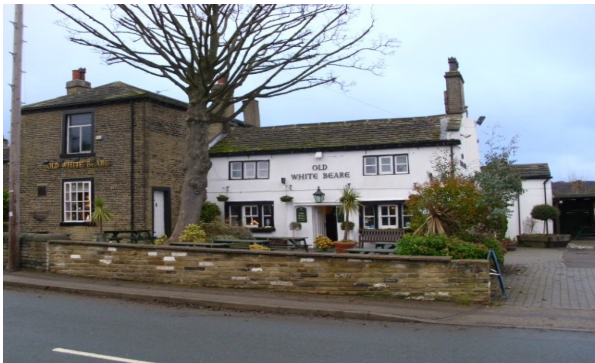
Old White Beare

At the top, go through a gate onto a rough lane. Turn right past a house to where a stile leads you along a path through the top of North Wood. At the end bear left through an opening into a field, where a small climb uphill towards a pylon, to a stile. Turn right and follow the wall side into a grassy lane leading to Middle Ox Heys Farm and the village street at Norwood Green .