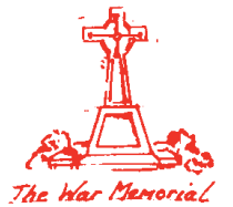
The War Memorial

Turn right out of the car-park towards the viaduct. About 50m before the viaduct fork left towards Z. Hinchliffe's Mill and walk under the viaduct. At the mill gate turn left along the fence and then right along the back of the mill and up to the main road.