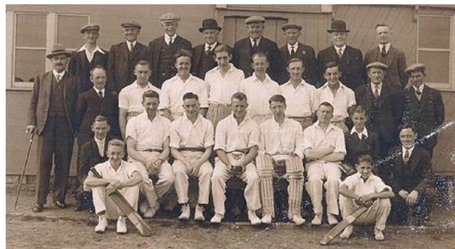
Cartworth Moor CC, 1935

Go through the gap in the wall and walk parallel with the next wall on your right. Pass through the stile to the right of the gate into the next field. Keep the wall on your left and then go through another stile with a rusty but ornate wrought iron gate. Follow the green track round to the right. The settlement you are passing through is called Hill House . Walk through Hill House (passing between the houses and their gardens) up the track until you meet the road. (There is a bench here on the left at which you may want to rest and enjoy the views). Cross directly over the road and go up Stony Gate . Just after the public footpath on the left Stony Gate becomes Gill Lane. As you walk up Gill Lane you will see to the right an incongruously large 'Welcome to CMCC' sign. The home of Cartworth Moor Cricket Club is a perfect place for a rest or picnic with its numerous benches and open outlook.