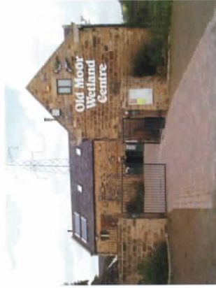
OLD MOOR VISITOR CENTRE

Please take the opportunity to stop and look around the Old Moor Visitor Centre where you will receive a warm welcome, refreshments and many interesting things to do and see. (Please check opening times before you plan your visit - Tel: 01226751593).