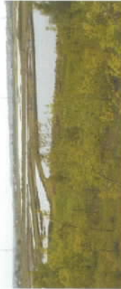
OLD MOOR NATURE RESERVE