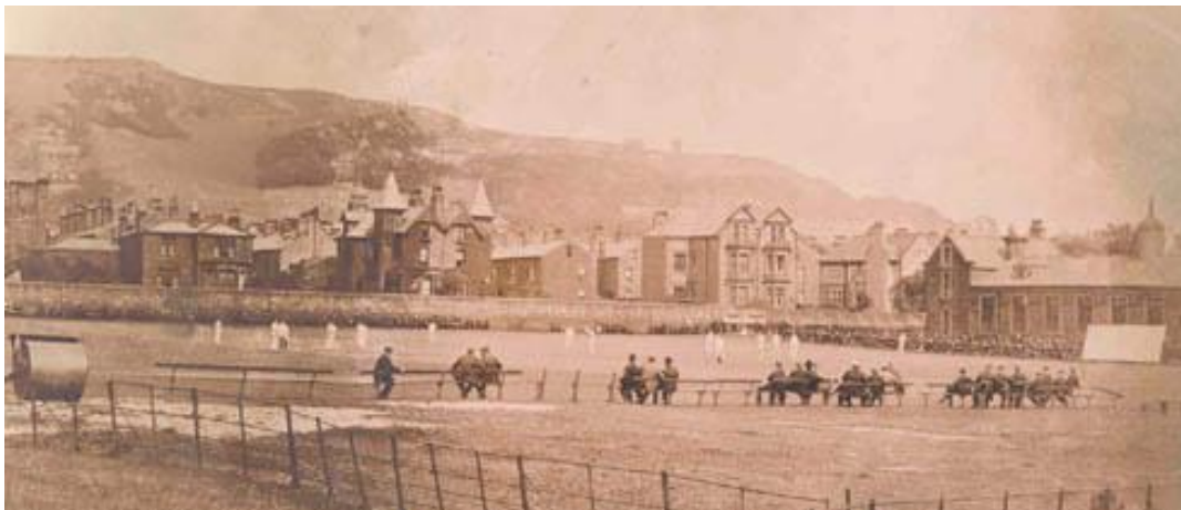
Centre Vale 100 years ago

On your left, you then meet Centre Vale , home of Todmorden Cricket Club , and also a public park .