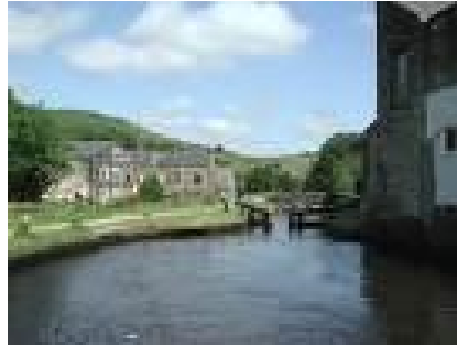
The Rochdale Canal at Walsden

If you're fond of guitar bands you'll be reassured to pass through the Travis Mill Lock 28. There's a church and school to your right, and then an excellent landmark on your left ( Grandma Pollard's Chippy – famous for its homemade pies!). Through a gap in the houses on your left you'll spot Walsden train station (could be useful later).