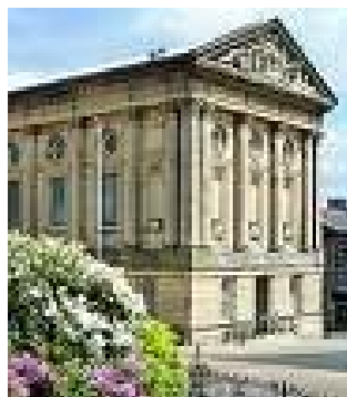
Todmorden Town Hall

Another church emerges on your right. When you come to the big green iron structure that spans the canal, come off the towpath and turn left into Todmorden town centre via the main road. Here there are lots of fine buildings to admire: an old Industrial Society building to your right, Todmorden Library on your left. St. Mary's Church and Todmorden railway station are also on your left. When you spot a small bridge to your right look out for a small plaque: have a guess what natural calamity struck the town in 2000.