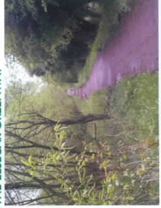
THE ELSECAR GREENWAY

17 Carefully cross over Pontefract Road then cross over the bridle bridge and bear left down the path under the flyover and the end of your journey.