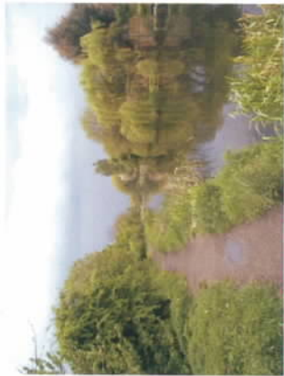
THE ELSECAR CANAL