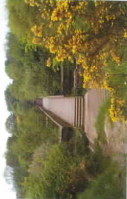
BARNLSLEY CANAL FOOTBRIDGE