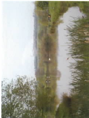
DEARNE VALLEY PARK

7 Follow the crushed brick path around the hillside and continue along the tarmac path as far as the former Railway Line which forms part of the Trans-Pennine Trail.