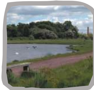
By the lake (See Waymarker 4)