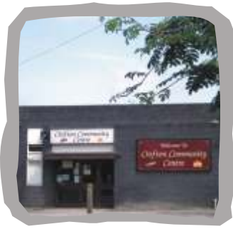
Crofton Community Centre (See Waymarker 1)