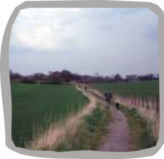
Path to Foulby Farm (See Waymarker 3)