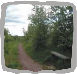
Red path through plantation