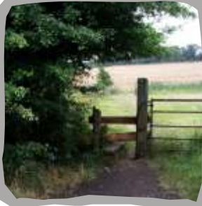
Stile to North Elmsall (See Waymarker 2)