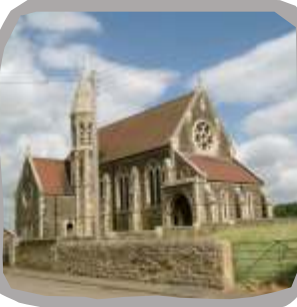
North Elmsall Church (See Waymarker 3)