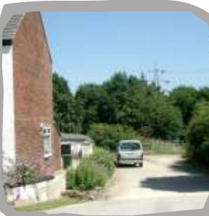
Path off roundabout (See Waymarker 6)