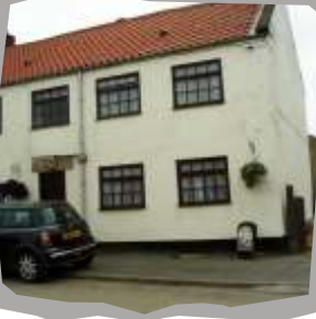
Mile Post House (See Waymarker 3)