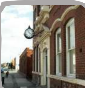
Old Town Hall (See Waymarker 6)