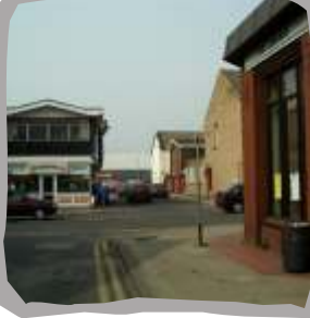
View down Wilson Street (See Waymarker 1)