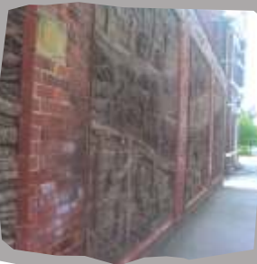
Town Hall Mural (See Waymarker 6)