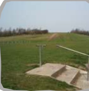
Supermarket steps (See Waymarker 2)