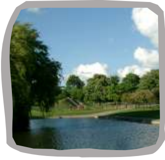
Park Lake (See Waymarker 3)