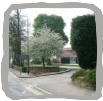
Entrance to Purston Park (See Waymarker 3)