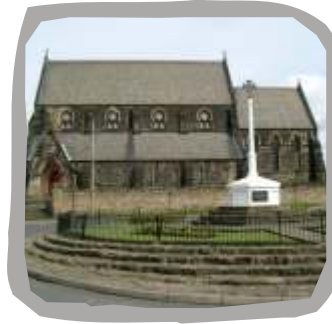
St Thomas Church (See Waymarker 5)