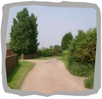
Girnhill Lane at Hawthorne Farm (See Waymarker 4)