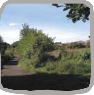
Dirt Road to Allotments (See Waymarker 2)