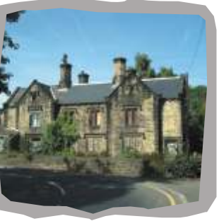
The Manor House (See Waymarker 3)