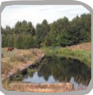
Barnsley Canal (See Waymarker 5)