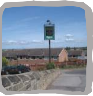
Walton Social Club Car Park (See Waymarker 1)