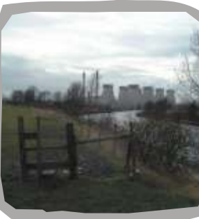
Stile on path to Pottery Lane (See Waymarker 5)