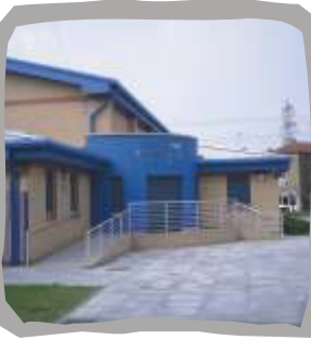
Ferrybridge Community Centre (See Waymarker 1)