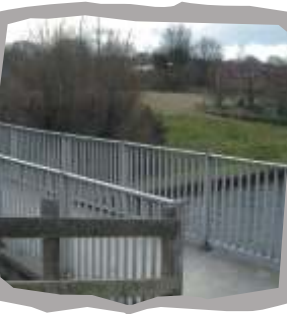
Footbridge over Canal