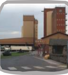
The King's Mill (See Waymarker 3)