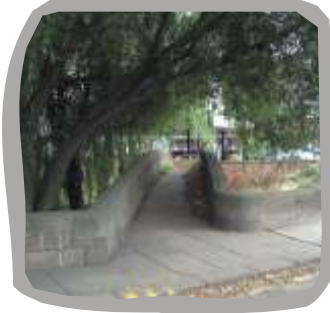
Pack Horse Bridge