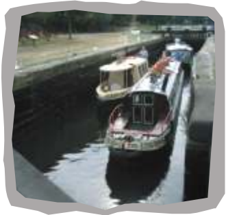
View from canal bridge (See Waymarker 3)