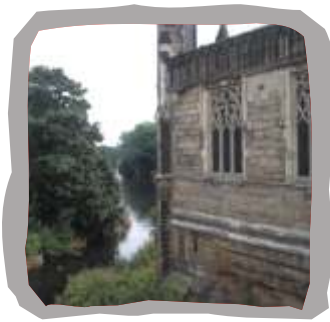
River Calder (See Waymarker 2)