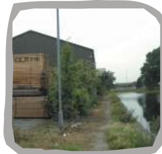
Timber Yard (See Waymarker 4)